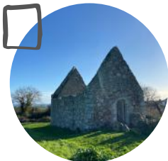
St Crispin's Cell